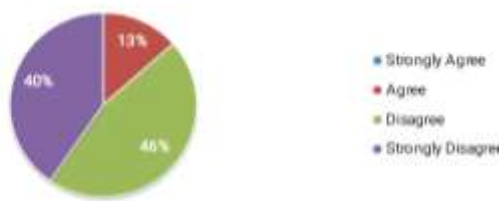
Behavior Transformation after Understanding the Dark Joke

There is one statement included in this indicator. In this last statement, only 14% participants answers agree that after understanding about dark joke, they become less care if their friends or other person got offended or not when using dark joke in daily conversation. However, 86% students' responds disagree. It can be said that after understanding about dark joke, they are not becoming less care if their friends or other person got offended or not when using dark joke in daily conversation.