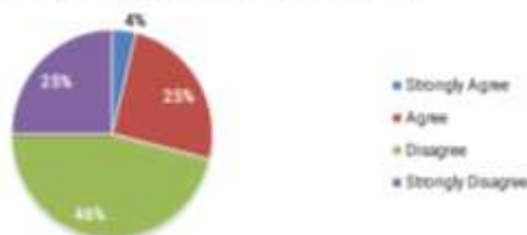
Student Feeling when Using Dark Joke

There is only one statement which is included in this indicator. In this statement, More students answered disagree than those who answered agree. 29% students answer agree that they are happy when using dark joke in daily communication or conversation. However, 71% of them answer disagree. This means they are not happy when using dark joke in daily conversation for some reason.