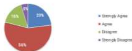
The Platform in Knowing Dark Joke

result above, it can be concluded that most of the respondents' understanding about dark joke is high.