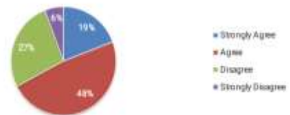
The Influence of Emotional State in Student Opinion about the Dark Joke

There are 2 statements that are included in this indicator. 67% of the respondents agree that their mood can affect themselves in responding a dark joke and dark joke itself can affect their mood whether it is advantageous to detrimental mood or vice versa. However, 33% of the students disagree. It can be said that mood is not affecting themselves in responding a dark joke and dark joke does not affect their mood after all.