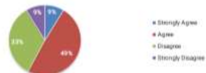
Attitudes Transformation after Understanding the Dark Joke