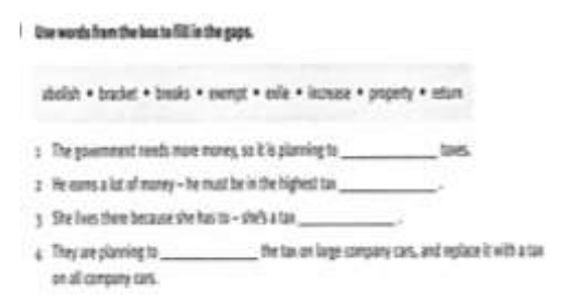
Figure 3. A deducing-meaning task

Concerning the focus of the activities, most activities are focused on meaning understanding rather than language system understanding. In fact, there is almost no activity which promotes the teaching or internalization of language system (rules or forms). Some activities combine the focus meaning/system/form relationship, but they do not explicitly teach rules. For example, learners are asked to match some accounting terms and definitions. In order to do the task successfully, learners need to focus on the meaning of each word, not the form. This is in line with Nunan as cited by Saragih (2014) who urges that in designing tasks that promote the use of authentic language, the emphasis should be on meaning, not on form. Norris and Ortega (2001) as cited in (Ollerhead & Oosthuizen, 2012) remark that focus-onmeaning approach concerns with giving exposure of meaningful input, so that the process of language acquisition is more incidental, rather than intentional. This is what Krashen pinpoints as a natural approach of language acquisition. Concerning mental operation, almost all cognitive skills are taught through the tasks, but the most frequent mental operation that is promoted is deducing meaning. An example of a task which requires deducing meaning can be seen in the figure below taken from Unit 1.